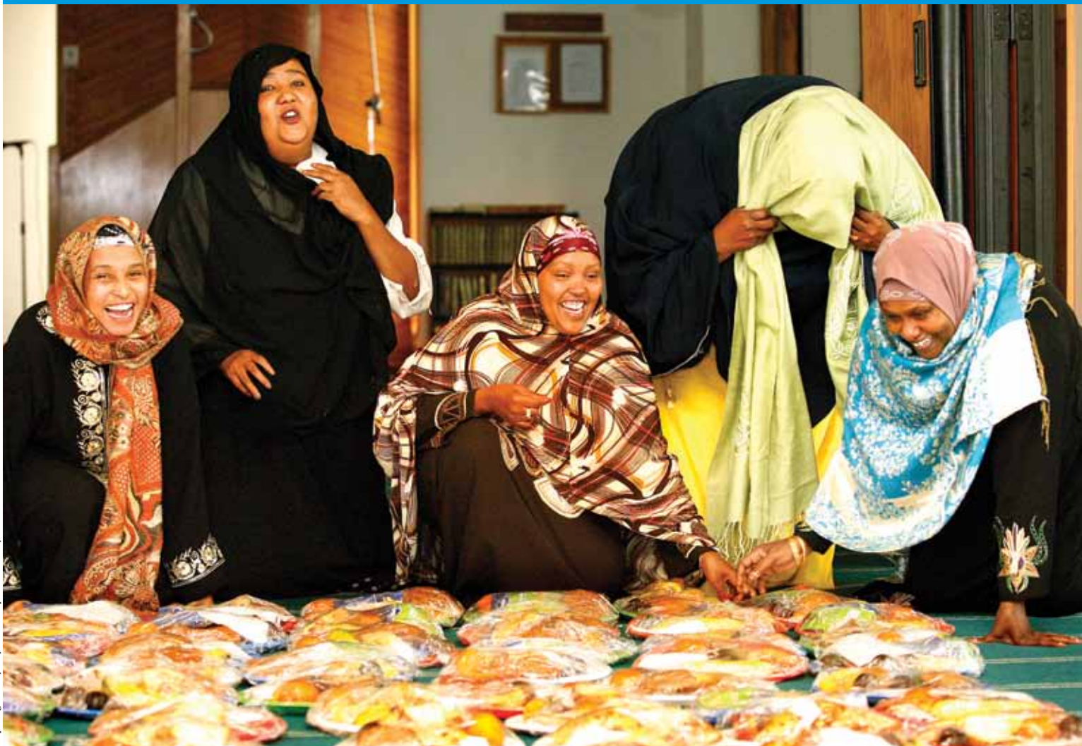
Preparing Somali food for disaster personnel.